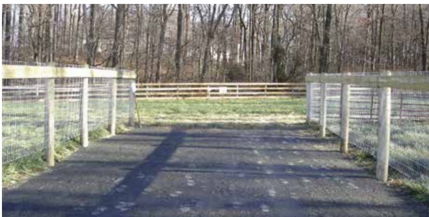
Completed heavy use pad.