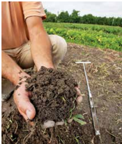
An inexpensive soil test can help you determine the type and amount of fertilizer needed for good pasture growth.

There is an old saying, “Take care of your soil, and your grass will take care of itself.” Soils vary widely, even across your pastures. So to begin, you must know your soil type, pH (acidity or alkalinity), and its capacity to hold water and nutrients.