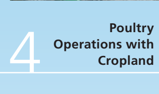
Poultry Operations with Cropland