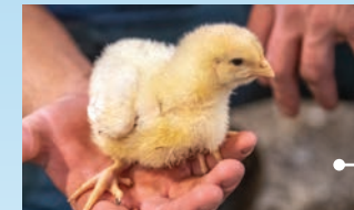
Poultry Operations with No Cropland