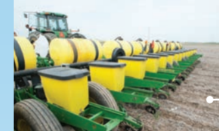
Crop Operations Using Commercial Fertilizer Only